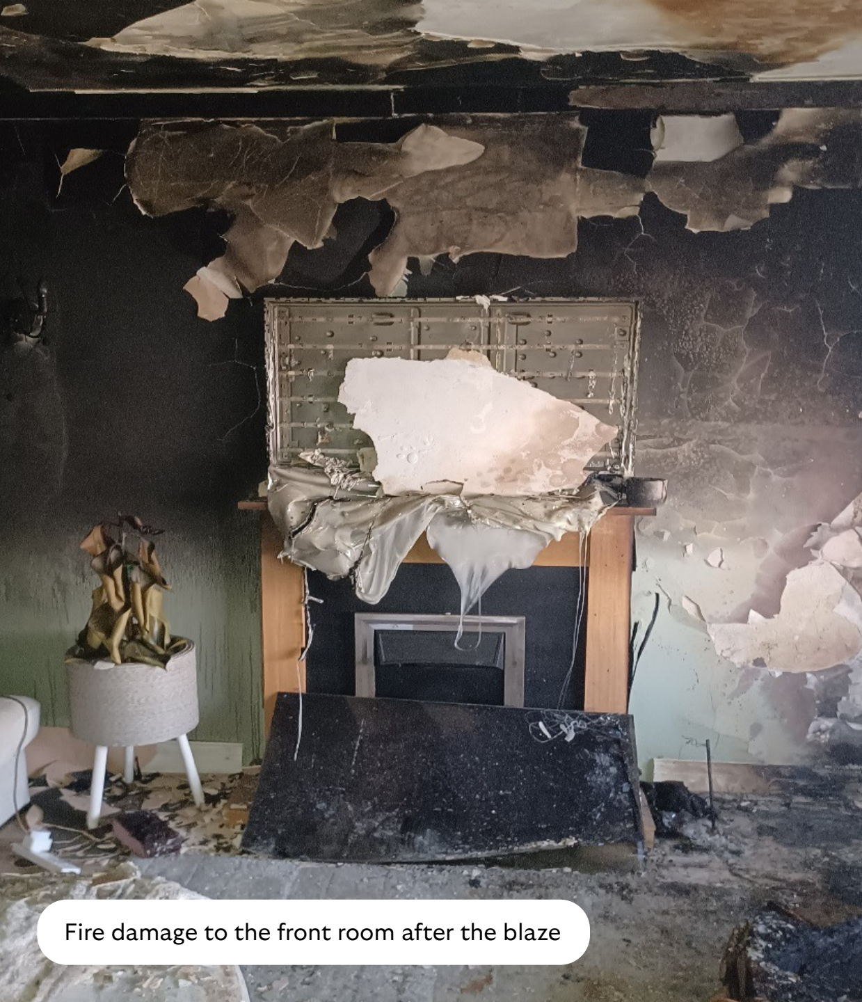
Fire damage to the front room after the blaze