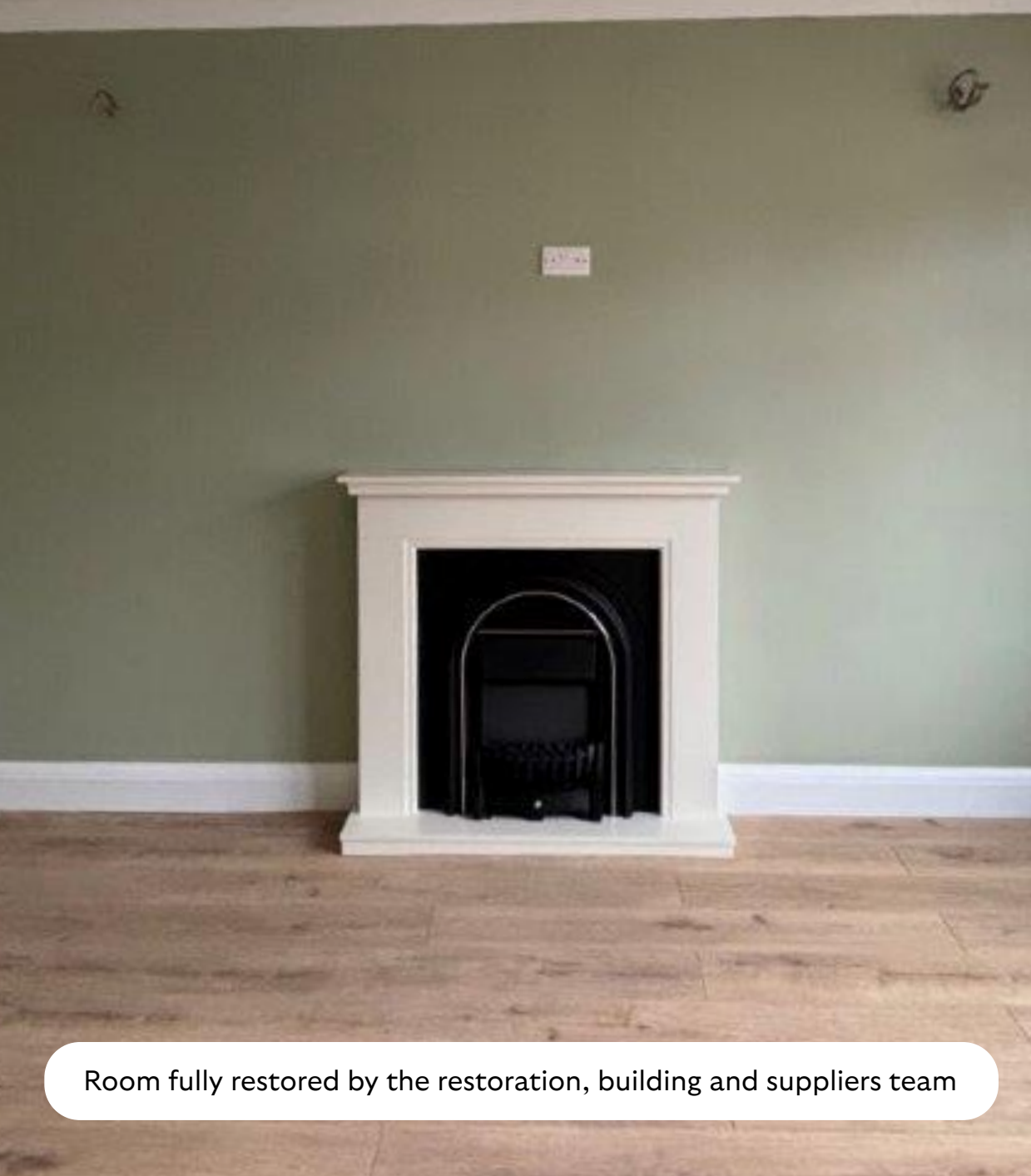
Room fully restored by the restoration, building and suppliers team